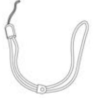
Wrist Strap (x1)