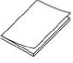
User Manual (×1)